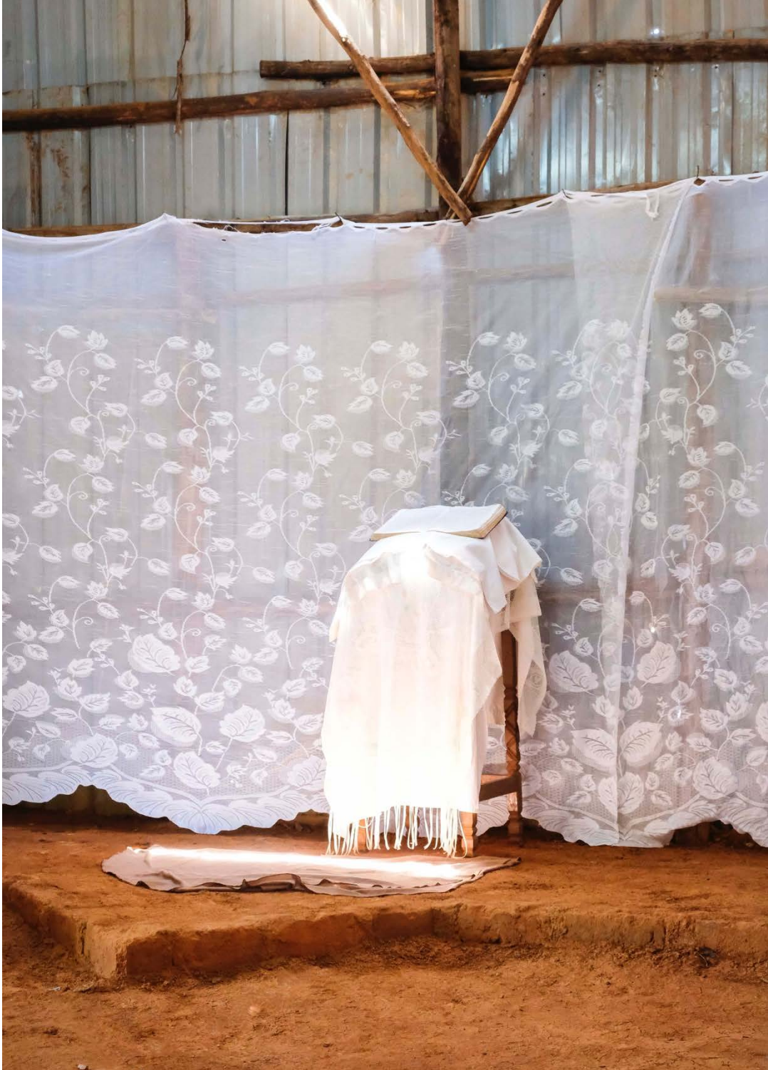
New Church Etora (Etora, Kenya)