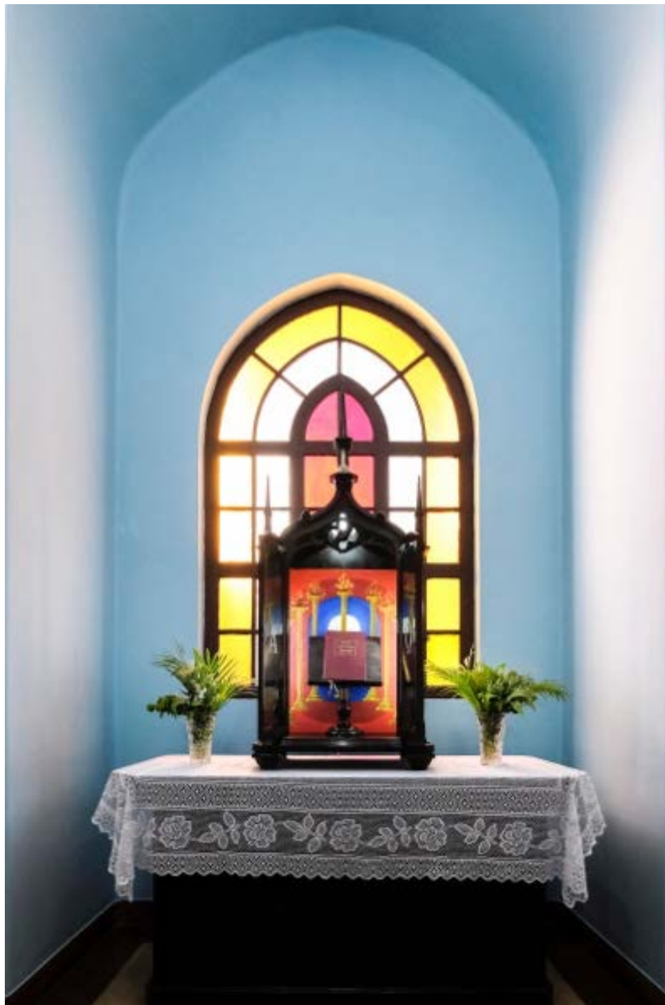
The Fatima New Church in Brazil (Rio de Janeiro, Brazil)