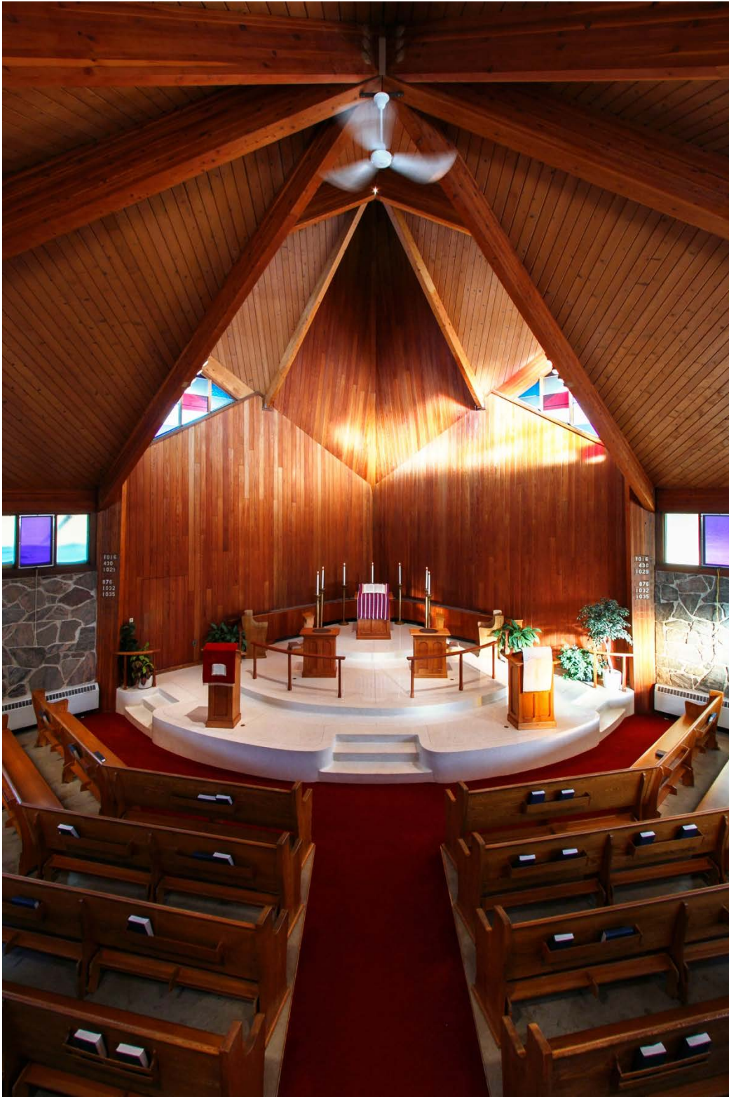
Carmel New Church (Caryndale, Canada)