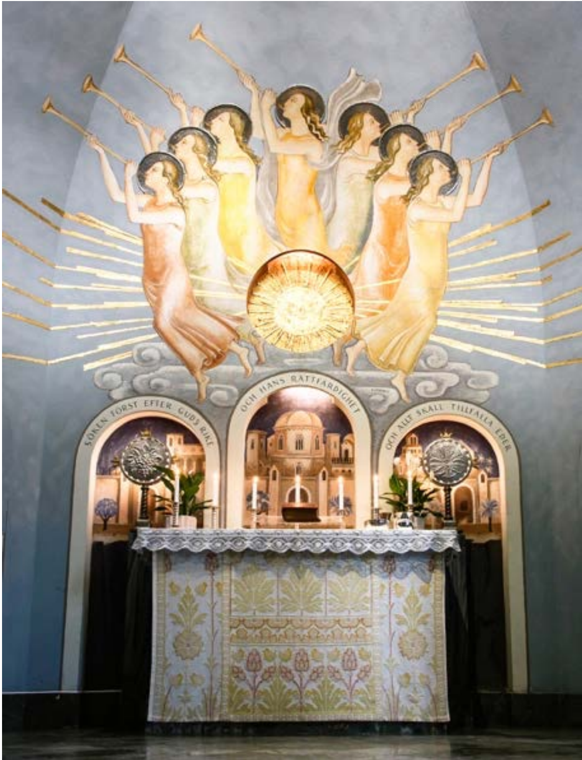
The New Church Society in Stockholm (Stockholm, Sweden)