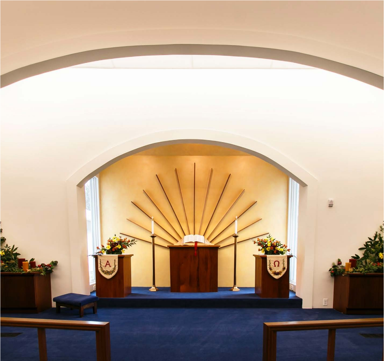
Washington New Church (Mitchellville, Maryland, USA)