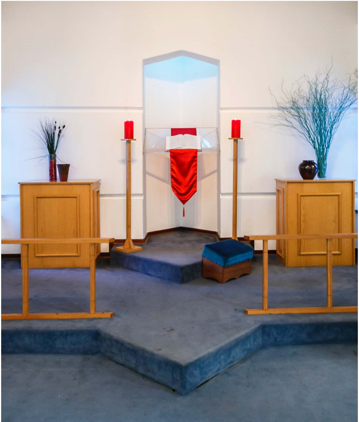
The New Church Buccleuch (Buccleuch, South Africa)