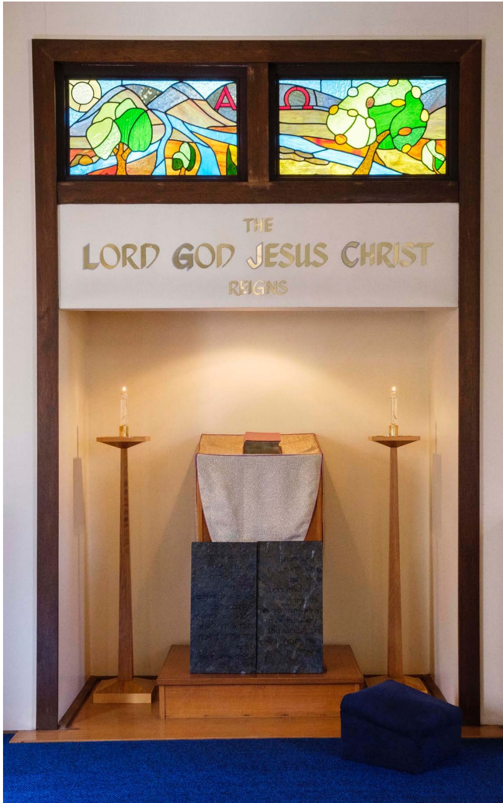
Hurstville New Church (Hurstville, Australia)