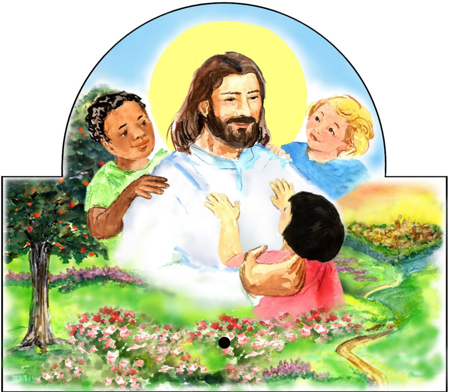
My Heart and Heaven