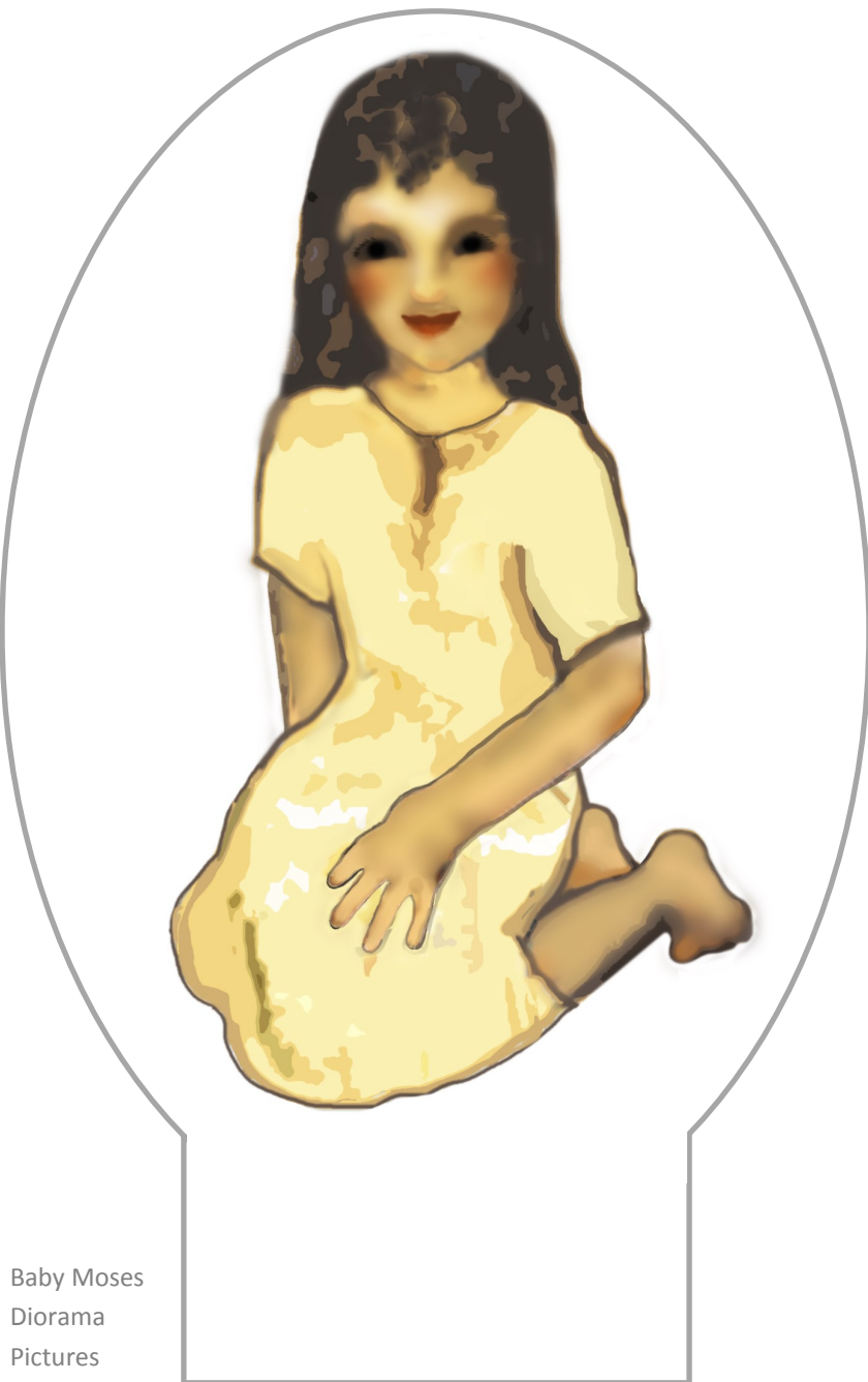
Baby Moses Diorama Pictures