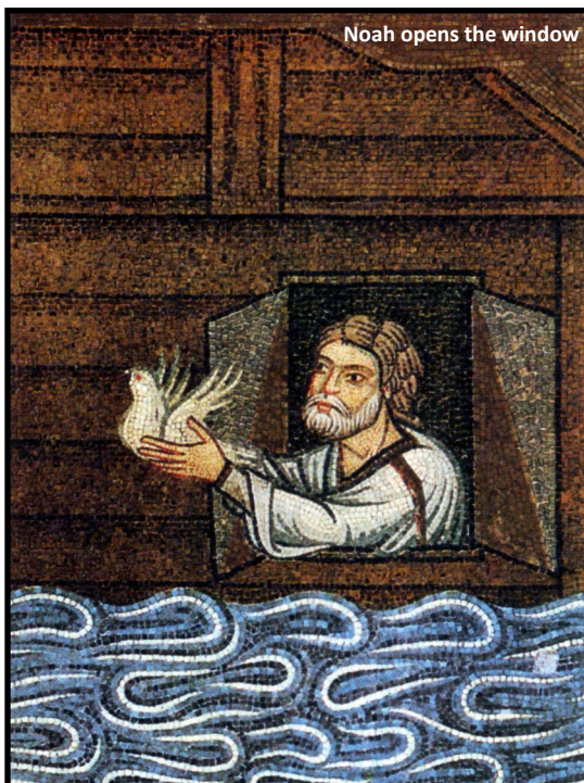
Noah. Mosaic in Basilica di San Marco, Venice.

The Lord gave the Christian Church the New Testament. It tells us about the Lord’s life and ministry in this world, and about His earliest followers, the twelve disciples. The Lord sent His disciples out to teach the news of His coming. The final book of the