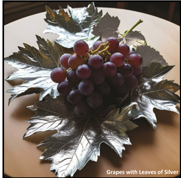
Grapes with Leaves of Silver

The angels worshiped in magnificent temples made from blue gemstones. They lived in a city in beautiful homes. When Swedenborg was invited into a home, he saw decorative artwork on the walls, and small silver statues. These objects helped the angels think about the happiness of marriage. Then suddenly, a flaming rainbow appeared on the wall. It was purple, blue and white. These colors pictured the love the husband and wife brought to their marriage.