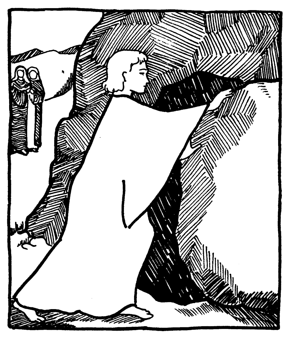
Now after the Sabbath, as the first day of the week began to dawn, Mary Magdalene and the other Mary came to see the tomb. And behold, there was a great earthquake; for an angel of the Lord descended from heaven, and came and rolled back the stone from the door, and sat on it.