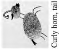
Curly horn, tail