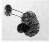
2 lines for neck