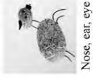
Nose, ear, eye