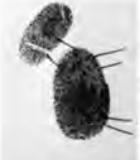
4 lines for legs