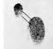
2 lines for neck