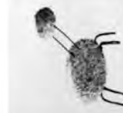
4 lines for legs