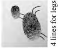
4 lines for legs