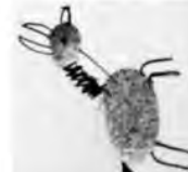
Nose, ears, eye