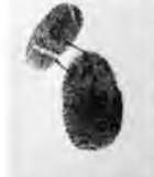
2 lines for neck