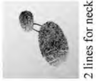
2 lines for neck