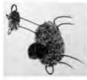
Ears, nose, tail