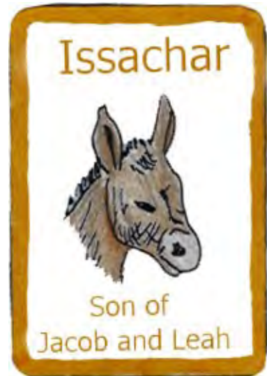
Abraham, Isaac and Jacob Family Tree Rummy Cards