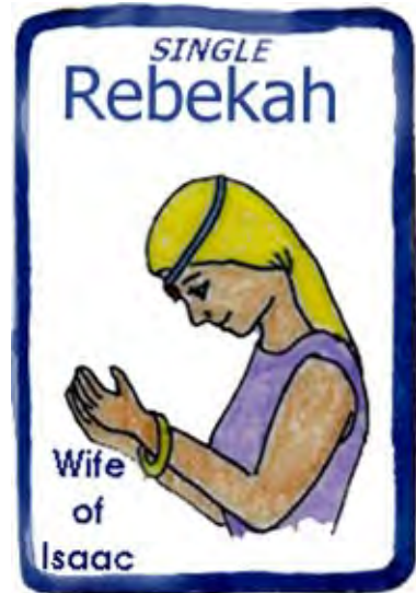
Abraham, Isaac and Jacob Family Tree Rummy Cards