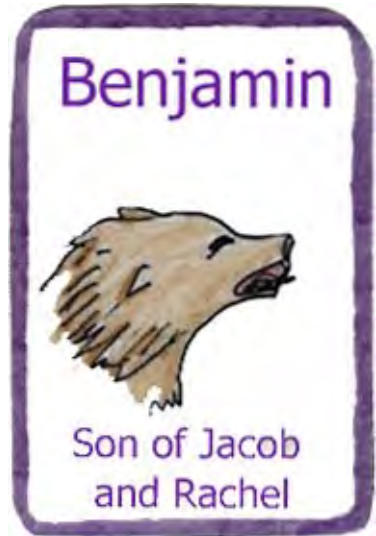
Abraham, Isaac and Jacob Family Tree Rummy Cards