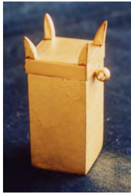
Altar of Incense (Gold)