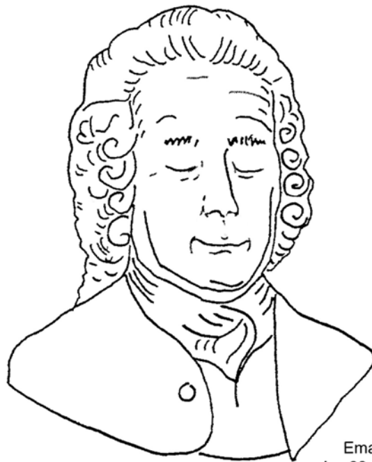
Emanuel Swedenborg Jan 29, 1688 - Mar 29, 1772