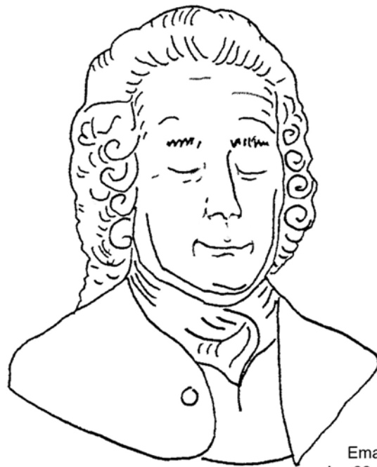
Emanuel Swedenborg Jan 29, 1688 - Mar 29, 1772