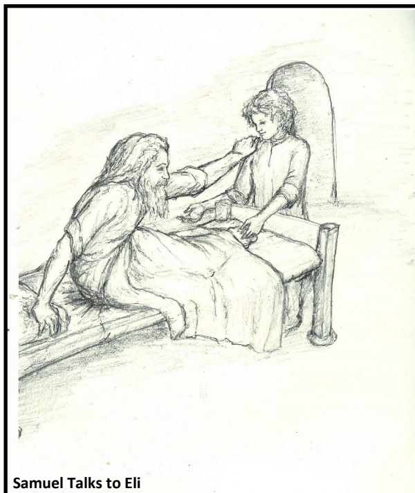
Samuel Talks to Eli

Samuel was still a young boy when he heard the voice of the Lord in the night. All through his life, Samuel listened to the voice of the Lord and obeyed Him. The people trusted him, and recognized that he had very special work to do for the Lord.