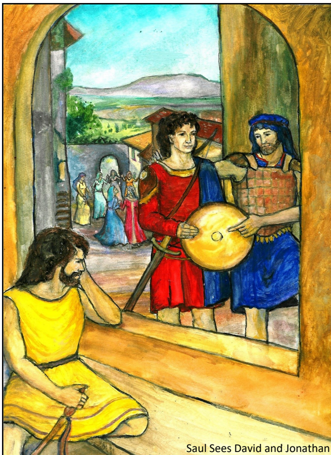
Saul Sees David and Jonathan

“And it was so, when he had finished speaking to Saul, that the soul of Jonathan was knit to the soul of David, and Jonathan loved him as his own soul.” (1 Samuel 18:1)