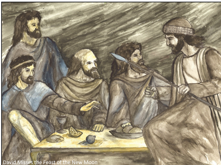
David Misses the Feast of the New Moon

“Why should he be killed? What has he done?” (1 Samuel 20:32)