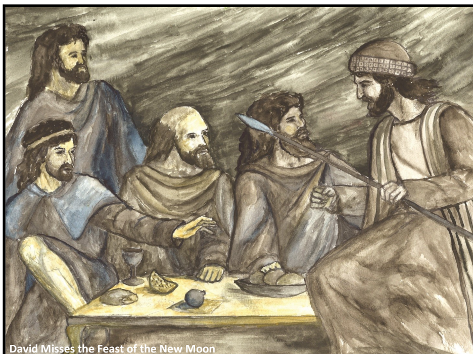
David Misses the Feast of the New Moon

“Why should he be killed? What has he done?” (1 Samuel 20:32)