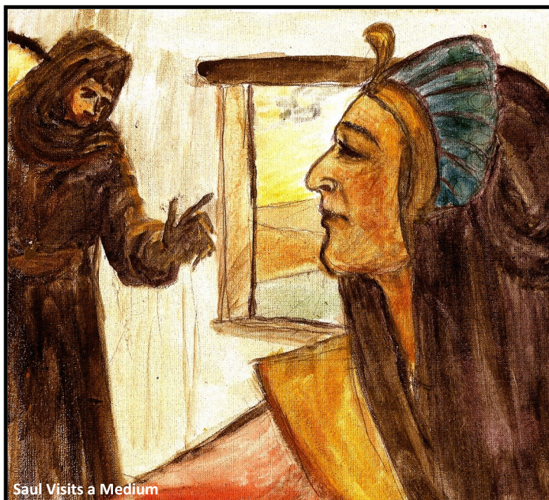
Saul Visits a Medium

The spirit of Samuel gave Saul a dreadful message. The Philistines would defeat Israel in battle. Saul and his sons would die. The Lord could not help him because he had turned away from Him. He also reminded Saul that the kingdom would be taken away and given to David. Samuel’s words terrified Saul. He had not eaten