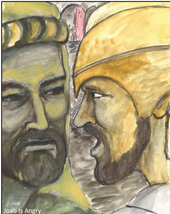
Joab Is Angry

“The Lord shall repay the evildoer according to his wickedness.” (2 Samuel 3:39)