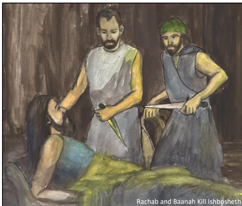
Rachab and Baanah Kill Ishbosheth

The Lord asks us to question our own motives from time to time. We do not always do things for the right reasons, but the more we do things because they are right, the happier we will be.