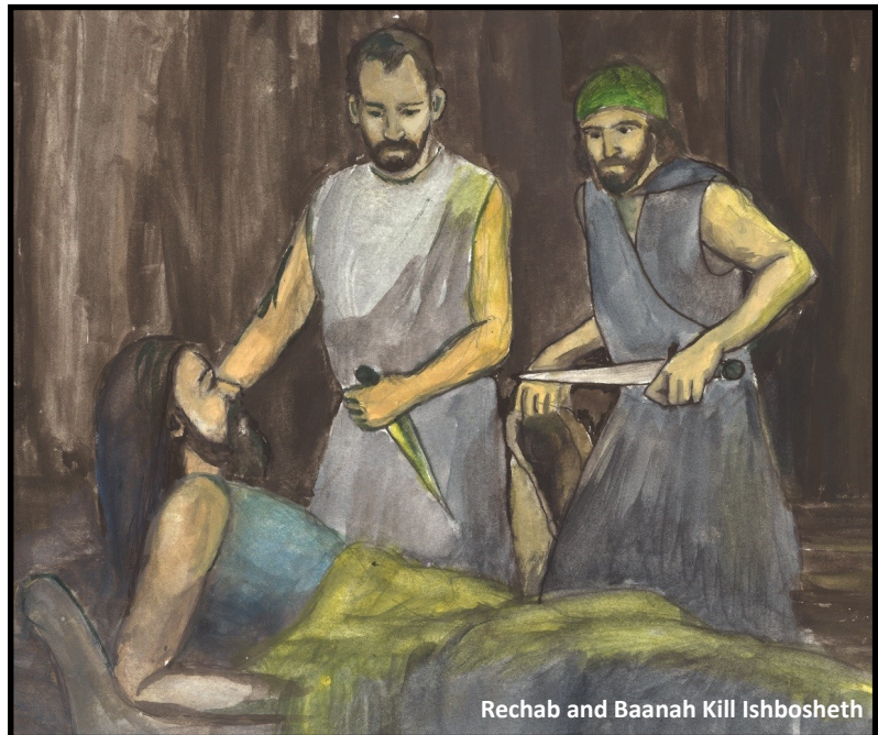
Rechab and Baanah Kill Ishbosheth

The Lord asks us to question our own motives from time to time. We do not always do things for the right reasons, but the more we do things because they are right, the happier we will be.