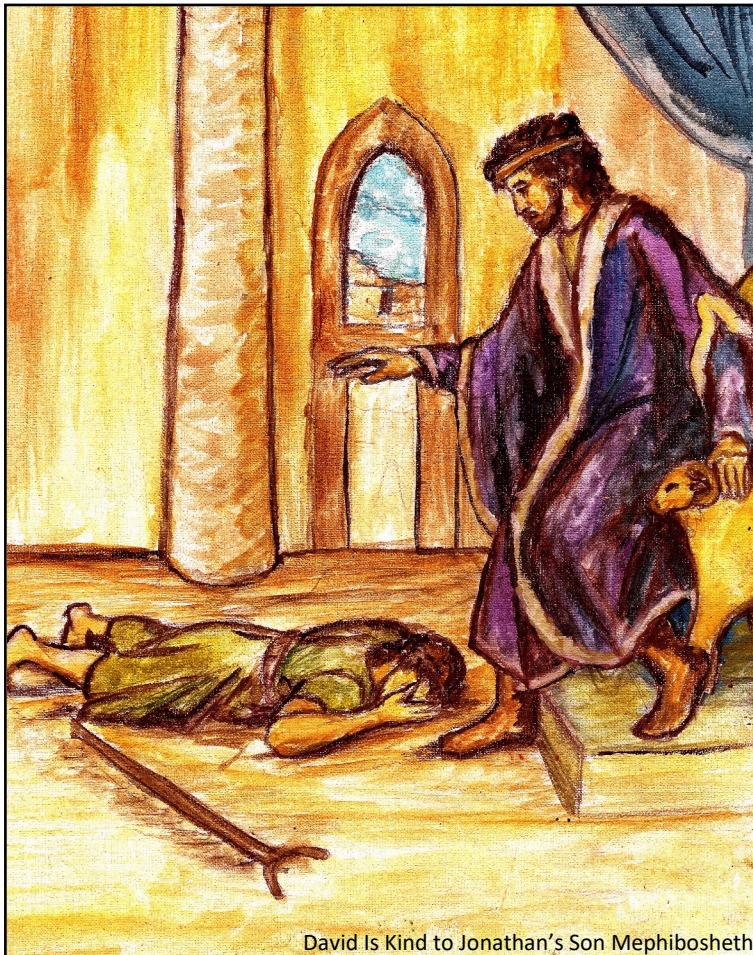
David Is Kind to Jonathan's Son Mephibosheth

Jonathan's son was called Mephibosheth. As Saul's grandson, he should have been king after his brothers died. But the Lord had taken the kingdom away from Saul and given it to David.