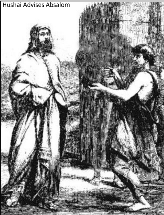
Hushai Advises Absalom

Absalom wanted to be sure he was doing the best thing so he asked Hushai what he thought. Hushai knew that if Absalom took Ahitophel's advice he would win. David needed time to get away and prepare for battle. Hushai needed to give advice that would help David, but would sound so convincing that Absalom would choose his plan.