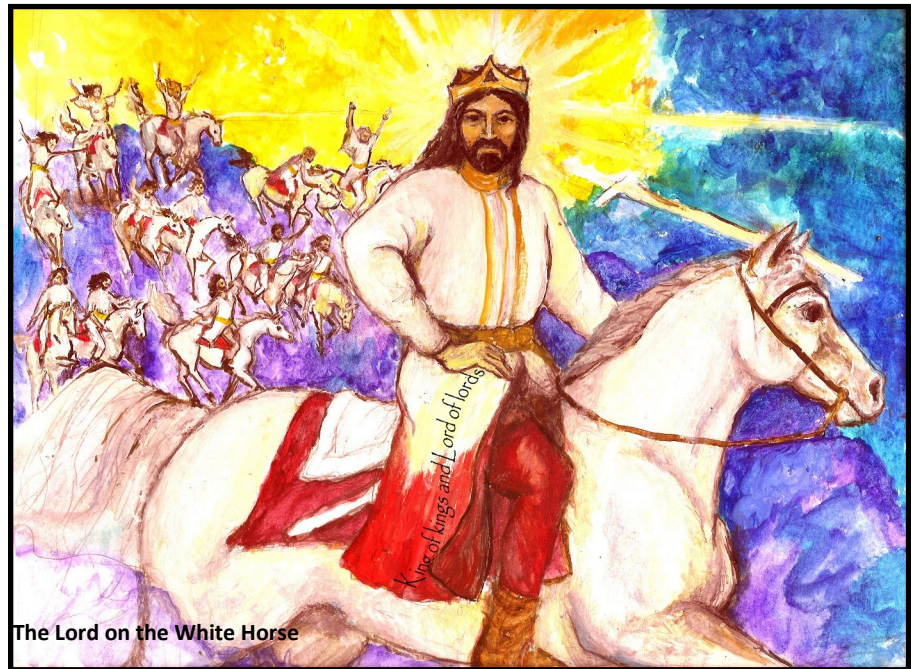
The Lord on the White Horse

As John watched events the Lamb of God, the Lord, opened the seven seals of the scroll. As He broke each seal, amazing visions appeared. Each one showed how after death, the Lord would separate people who loved Him and obeyed His commandments from those who chose to do evil things. When the final seal was broken, the good could be saved and the evil were