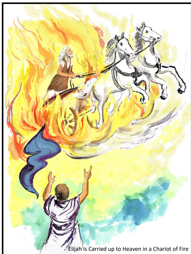
Elijah Is Carried up to Heaven in a Chariot of Fire

After this, Elisha picked up Elijah’s mantle. This powerful image shows Elisha willingly taking on the challenging and even dangerous work of being the Lord’s prophet. Then he used the mantle to repeat Elijah’s miracle of parting the river Jordan. As he did so, he called out to the Lord, as if asking Him for the power that was Elijah’s. The Writings tell us that a “mantle” stands for Divine truth. This is why Elijah first threw his mantle over Elisha, and then at his death let the mantle pass to Elisha. This showed the representation and the transfer of the power of the Word from Elijah to Elisha.