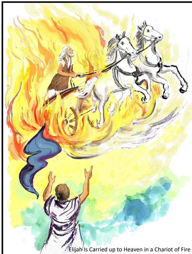
Elijah Is Carried up to Heaven in a Chariot of Fire

Immediately after witnessing Elijah being carried into heaven, Elisha tore his own clothes into two pieces, demonstrating his grief. The Heavenly Doctrine tells us it also was a sign of sadness that the Lord’s Word was being lost to the people. Elisha tore his own clothes apart to