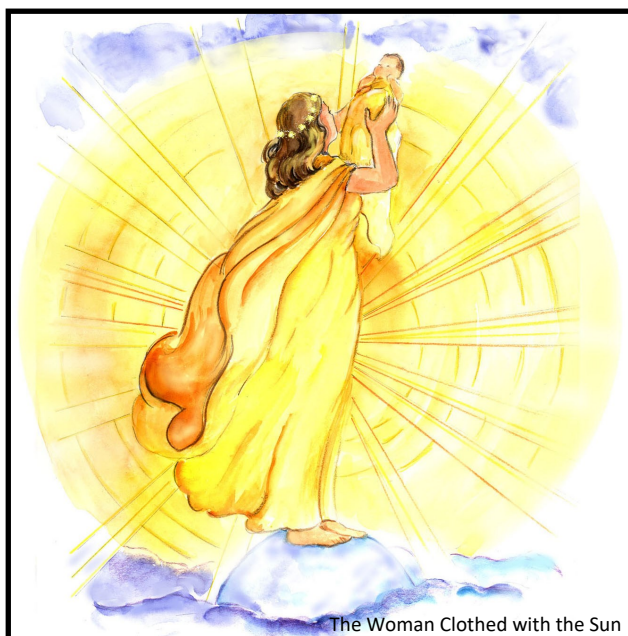
The Woman Clothed with the Sun

One of the most dramatic visions was of a woman clothed with the sun with the moon under her feet and a crown of twelve stars on her head. She was ready to give birth to a baby, but a fiery red dragon threatened the woman and her unborn child.