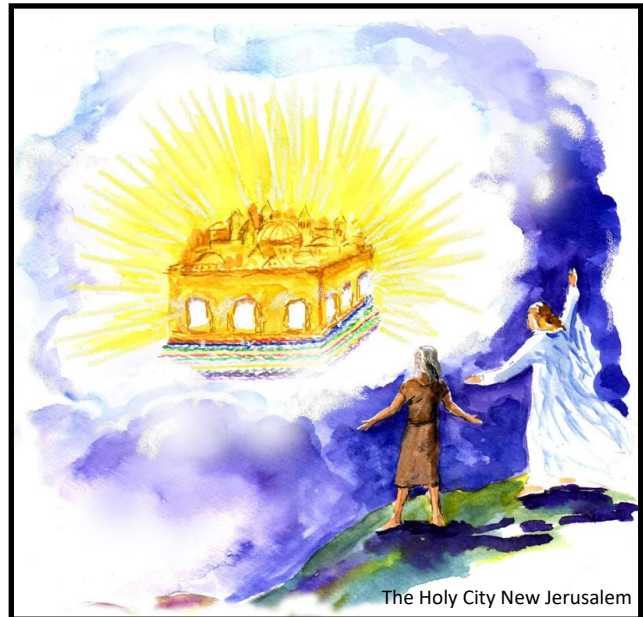
The Holy City New Jerusalem

[An angel showed John] the great city, the holy Jerusalem, descending out of heaven from God, having the glory of God.... Also she had a great and high wall with twelve gates, and twelve angels at the gates.... And the city was pure gold, like clear glass. The foundations of the wall of the city were adorned with all kinds of precious stones (see Revelation 21:10-12, 18, 19).