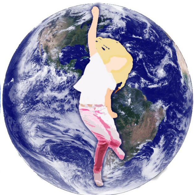
Earth - Commandments Mobile