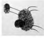
4 lines for legs