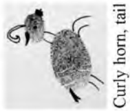
Curly horn, tail