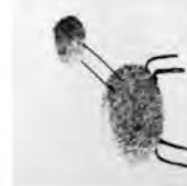
4 lines for legs