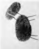
4 lines for legs