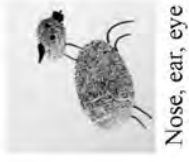
Nose, ear, eye