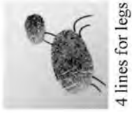
4 lines for legs