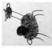
Ears, nose, tail