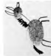
Nose, ears, eye