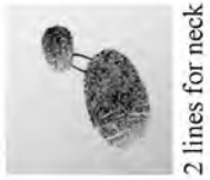
2 lines for neck