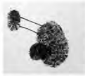
2 lines for neck