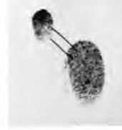
2 lines for neck