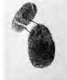
2 lines for neck