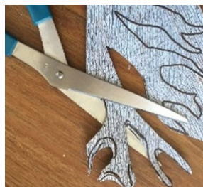
8. Finish cutting out the tree. Then unfold the three flaps.