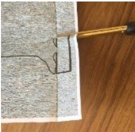
6. Unfold the pages and cut a slit up the center of each base.