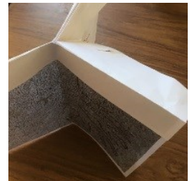
5. Glue the two remaining single flaps together to form a Y shape.