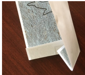
2. Fold each tree page in half with the blank side showing.