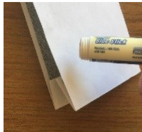
3. Rub glue on the top side of one page. Place another folded page on top and press to glue.