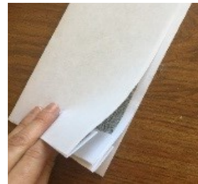
4. Glue the last page on top of the other two in the same way.