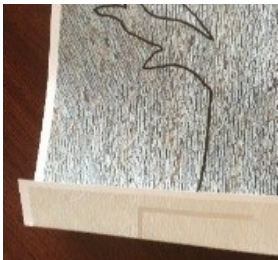
1. Fold the rectangular base of each tree page up toward the trunk.