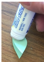
11. Add glue to the base of one side of the leaf.