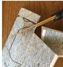
7. Fold all pages together. Start from the base to cut out tree.