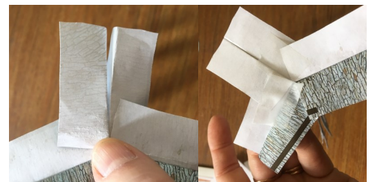
9. Fold the pieces of the bases over each other and tape together as shown.