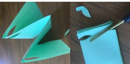
10. Accordion fold a green piece of paper and cut out leaf shapes as shown above. Do not cut through the folds.