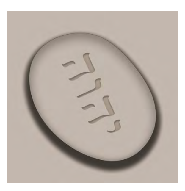
Five Smooth Stones