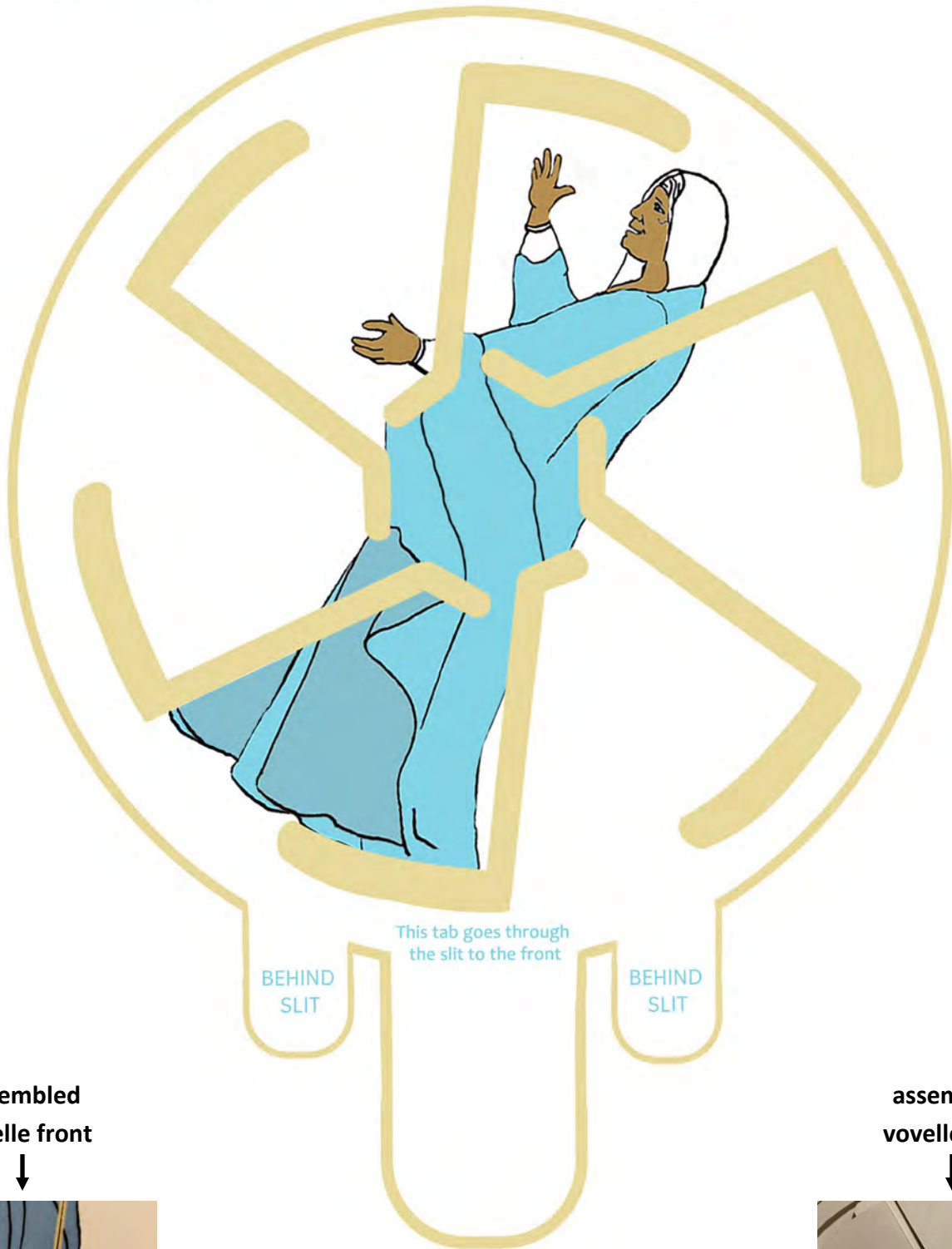
assembled vovelle front