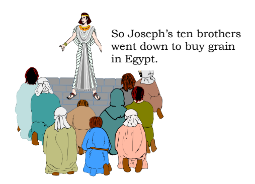
The Lord _____