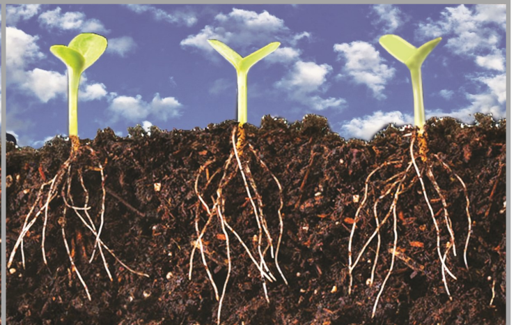
Sower Story Bag Cards