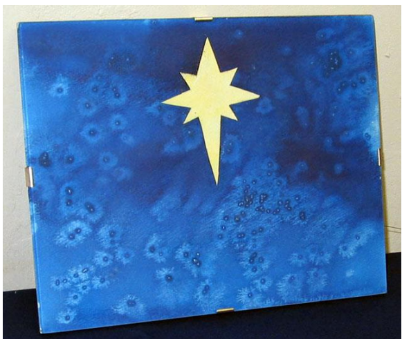
Star Painting in Glass Frame