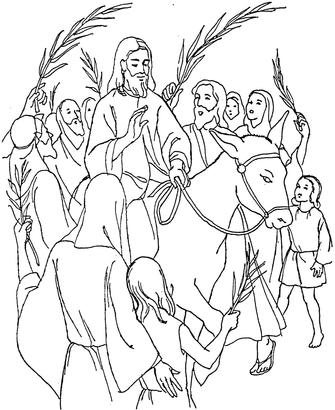
Riding in Majesty Matthew 21:9