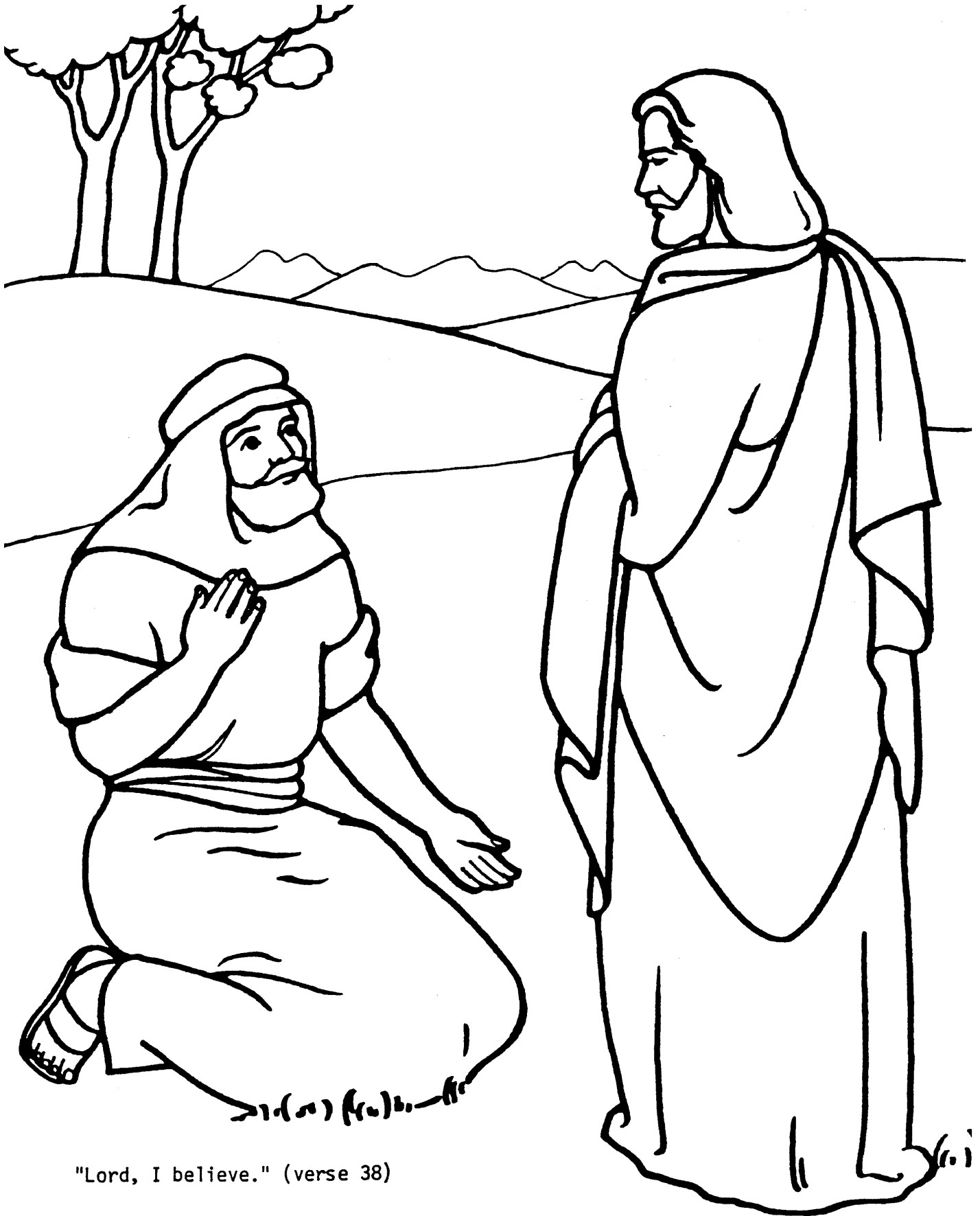
"Lord, I believe." (verse 38)