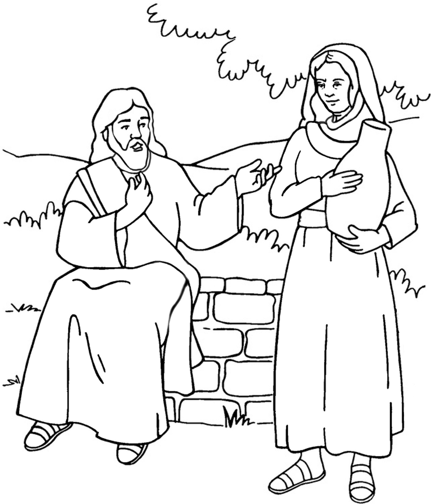
Jesus at the Well