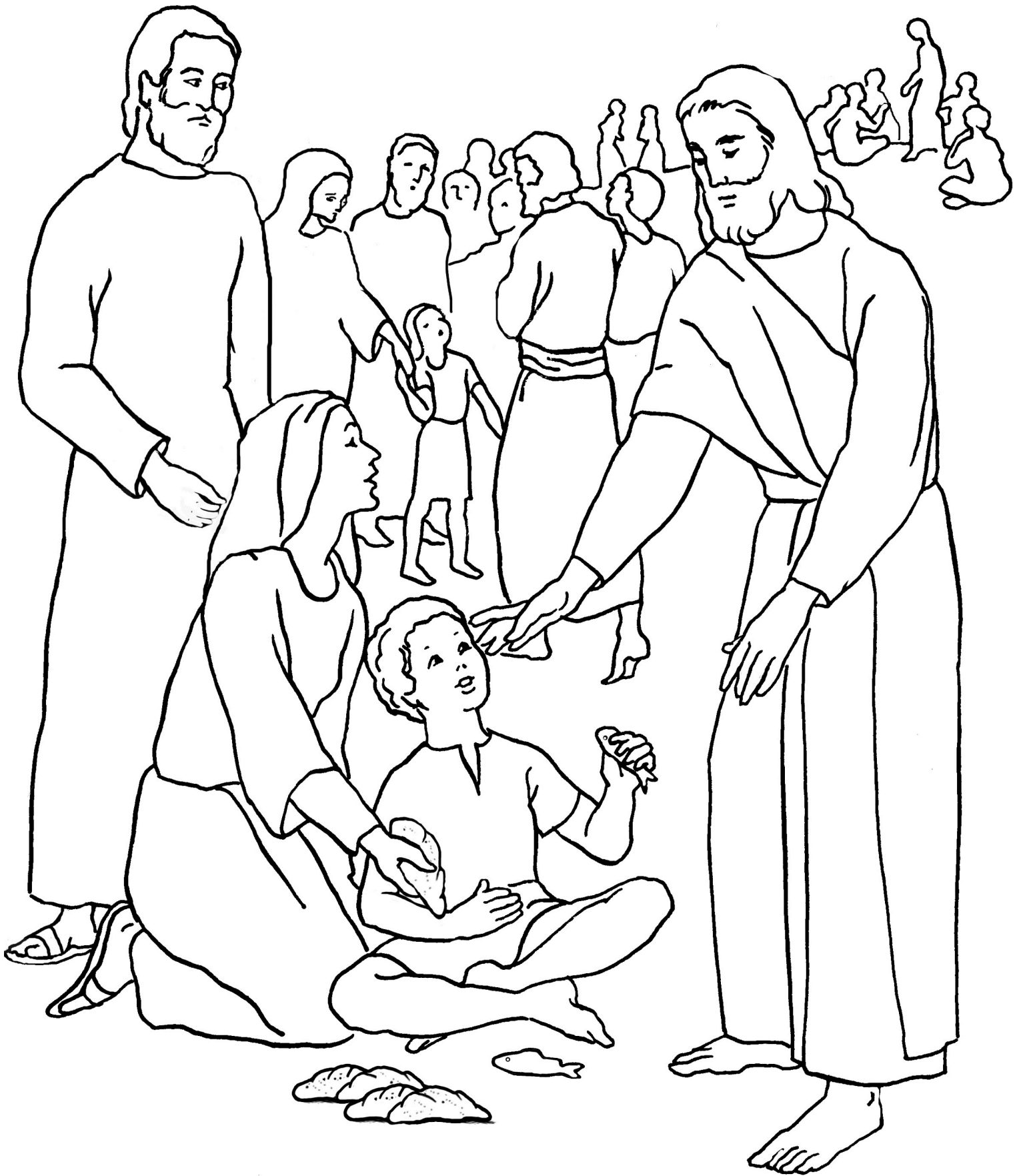
Feeding the 5000